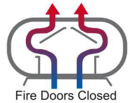
Fire Doors Closed