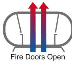
Fire Doors Open